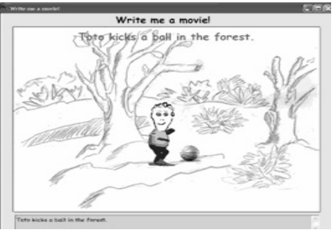
Figure 8: Display of the actor "Toto" on Story Maker

When the user is finished with the Sketch Pad UI, the graphics component adds the new face to the graphics library along with the actor's name (i.e., Toto)<sup>3</sup>. When the user enters a statement that includes the new actor's name, the NLP component associates the name (Toto) with an identical new MetaLex, Toto, and sends that information to the graphics component. The graphics component automatically loads the new face and places it on the top of a default 3D body. This body executes the action specified in the user's input.<sup>4</sup> Figure 8 is the screenshot of Story Maker for the statement, "Toto kicks a ball in the forest".