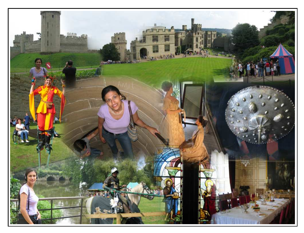
Figure 5: Further example of AutoCollage. Note again, the desirable and novel properties: hidden boundaries, little duplication, freedom from fragments, selective transparency.

in the center of a collage looks funny, I thought it's snow". Further user quotes: "Seeing an AutoCollage of your own photos is a surprisingly emotive experience."; "AutoCollage is a clear win on average; it is better proportioned than the others"; "AutoCollage is sometimes much better than Tapestry, however, AutoCollage is never worse than Tapestry. I'd also like to include a specific image".