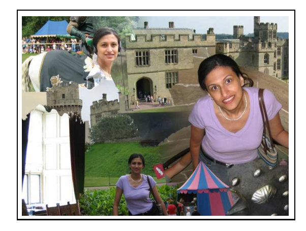
Figure 2: Problems with Tapestry. A collage produced using Tapestry [Rother et al. 2005] includes sky portions in the collage center and other small image fragments. Running AutoCollage on the same image set gives a superior result, see figure 5.

for fragments is quite simply infeasible in the Tapestry framework since it leads to a Markov Random Field with very large cliques, where standard methods such as graph cuts or Belief Propagation are no longer applicable. Here however this is possible thanks to the explicit constraint satisfaction step, which is one of the main innovations of this work — see figure 5.