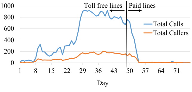
Figure 2. Call statistics for Sangeet Swara.

phone survey, which presented a single pre-recorded question to regular users each time they called. There were nine questions about basic demographic data (sex, age, education, technology exposure, etc.) and six open-ended questions probing the background of the listener (e.g., "tell us about yourself"), their conception of Sangeet Swara (e.g., "how would you describe Sangeet Swara to a friend"), the quality of community moderation, and the strengths and weaknesses of the platform. The survey was live for ten days. All responses were provided in audio format and then translated, transcribed, and analyzed using open coding and axial coding. A total of 204 people (out of 409 regular users) answered one or more of the survey questions, and each question was answered by at least 100 people. On average, free responses were 36 words long.