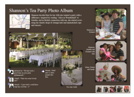
Figure 2b. Envisionment sketch of a photo album crafted out of various online media.