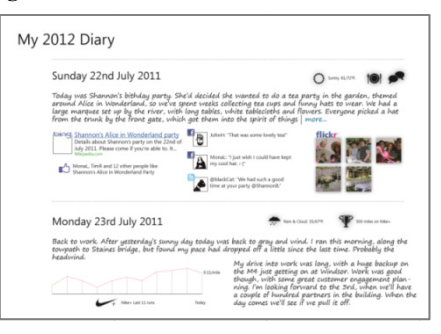
Figure 2a. Envisionment sketch of a diary (journal), with annotated events drawn from online media activity.