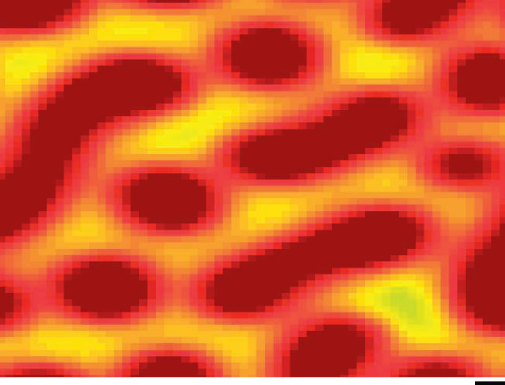
Programmer for life. Andrew Phillips ( right ) helped design software that tells how to engineer bacteria to grow in a "Turing pattern" ( above ).

logical processes. The unpublished preliminary models predict that the carbon stored in vegetation by 2100 will fall within the range forecast by previous models.