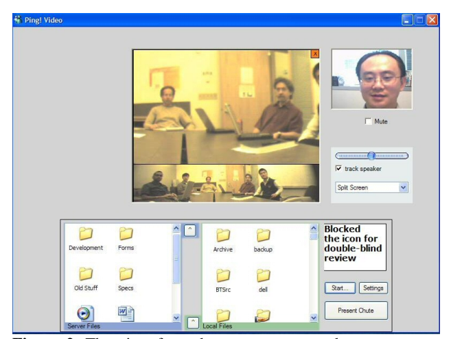
Figure 2. The view from the remote person; the upper-center portion is a live view from the meeting room: the person who is talking is shown at the top with high resolution, and the whole meeting room is shown at the bottom with low resolution. The upper-right portion shows the video of the local person him/herself. The bottom portion shows the UI for file sharing and transfer.