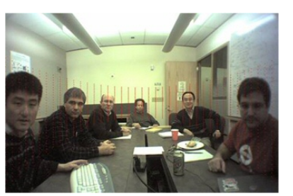
Figure 3. Stand-in device video before de-warping. The vertical lines show the warping mapping function.

In PING, we allow the user to write freely on un-instrumented whiteboard surface using a regular dry-erase pen. To achieve this, our system uses an off-the-shelf 1.3-mega-pixel Aplux MU2 video camera, which captures images of the whiteboard at 7.5 frames/sec. From the input video sequence, our computer vision algorithm separates people in the foreground from the whiteboard background and extracts the pen strokes as they are deposited to