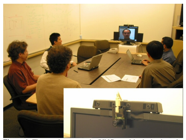
Figure 1. The meeting room; the PING stand-in device is at the end of the table, and consists of a flat panel monitor, a linear microphone array, a wide-angle camera, and two loudspeakers.

presented with a view of the meeting that is approximately the same as that one would get if sitting in the meeting itself. To achieve these goals, we selected a 20" LCD monitor. A wide-angle camera, a microphone array and two loudspeakers are placed as close to the monitor surface as possible to facilitate eye-to-eye contact, and to allow sound from the remote participant to appear to come from the monitor. As we will discuss later, the wide angle camera, when properly warped, provides a subjective experience much like sitting at the end of the table for the remote participant. Likewise, the microphone array provides the means to both focus the microphones "beam" and also to help detect the speaking person in the meeting room to automate a digital pan-tilt-zoom (PTZ) within the high resolution video.