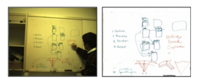
Figure 5. Live whiteboard capture. The image on the left is one of the raw image sequence captured by the whiteboard camera; the image on the right is the processed and enhanced image.

the whiteboard [1]. Furthermore, the images are white-balanced and color-enhanced for greater compression rate and better viewing experience than the original video, as shown in Figure 5. Our system can decide to remove the foreground person, keep the foreground person or semi-transparently show both the foreground person and the whiteboard content [1]. The whole process is automatic and real-time, which significantly enhances the meeting experience for people both in the meeting room and remote.