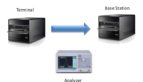
Figure 3: Demo setup.

We further show a simple LTE analyzer with our own decoder on Sora. It can graphically display the waveform and modulation points in a constellation graph, as well as the demodulated results. It has the basic functions of a commercial spectrum/protocol analyzer, but it is much cheaper.