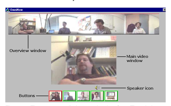
Figure 5: The user-controlled + overview interface. The window at the top is a 360-degree panoramic overview of the meeting room. The five buttons at the bottom are static images. Pressing these buttons changes the direction of the virtual camera. Pressing the fifth button gives control of the camera to the computer. The speaker icon above the buttons indicates who is currently talking.

Because the user has no control over the camera, only the view selected by virtual director needs to be stored