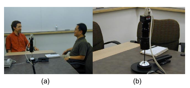
Figure 1. The omni-directional camera meeting capture environment. (a) People seated around the meeting table. (b) Close-up of the parabolic mirror and camera.

These issues can be overcome using an omni-directional camera. In contrast to previous omni-directional camera systems [10,16,22], our environment uses a high resolution (1300x1030 = 1.3 Mega pixels) camera to both track meeting participants and capture video at 11 frames per