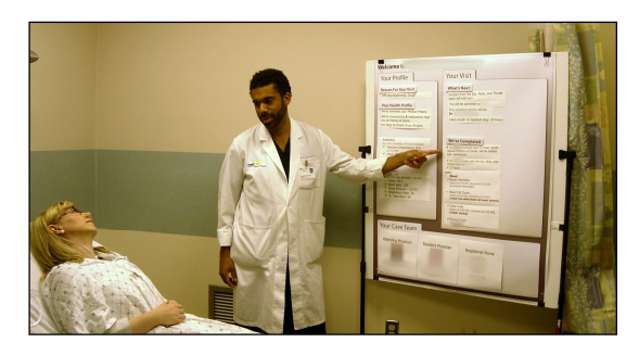
Figure 2. Staged illustration of patient discussing poster with physician, in actual deployment site.

While much of the information was collected from the EMR and from the patient's medical chart, all information presented on the prototype was screened by the patient's attending or resident physician before deployment, to avoid misinformation. These discussions also provided a valuable opportunity to collect targeted feedback from providers about presentation techniques, and to inform the process of building reports automatically. These exchanges will be discussed in more detail in the Results section.