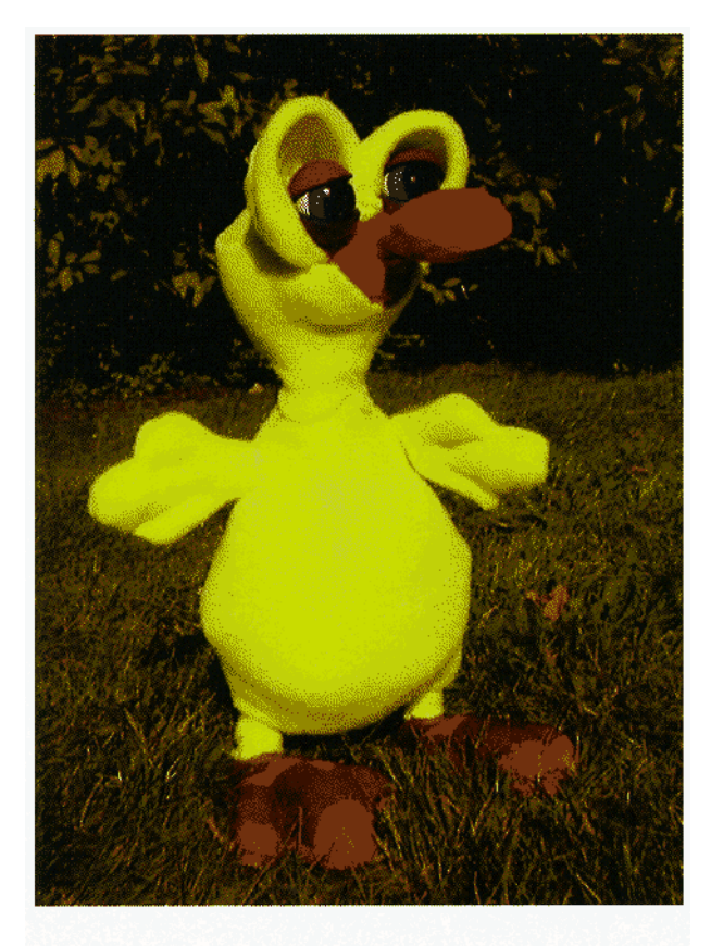
Color Plate 3: The external view of the doll.