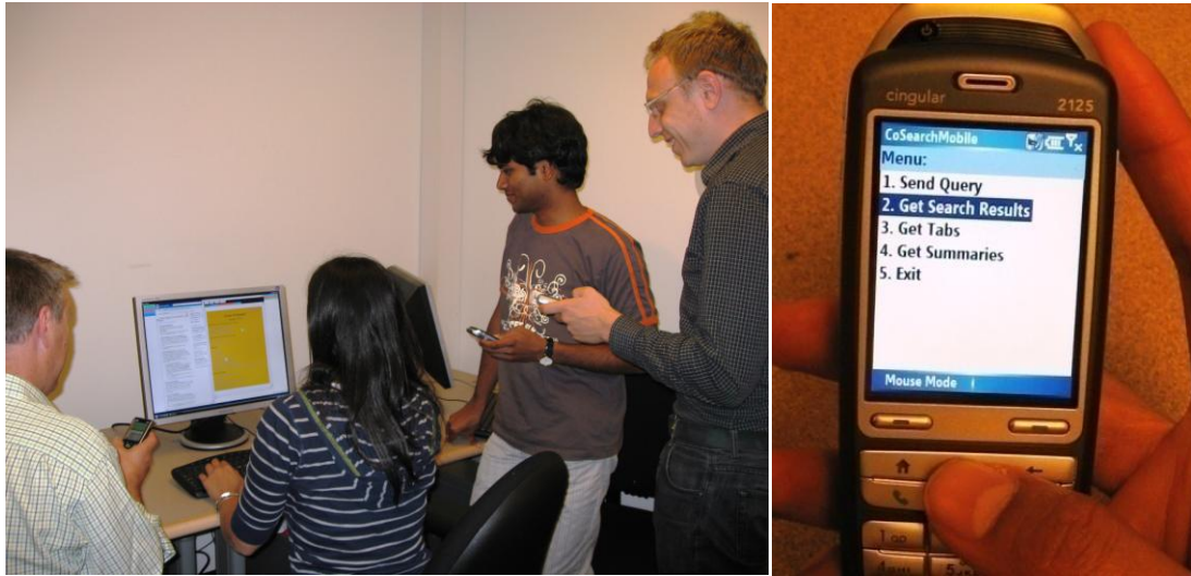
Figure 3. CoSearch facilitates co-located collaborative Web search (top left), via the CoSearchMobile (top right) and CoSearchPC (bottom) UIs. The “summary region” on the right-hand side of CoSearchPC displays the title, URL, and user-generated comments for any pages saved by the group. These summaries can be downloaded to group members’ cell phones via CoSearchMobile’s “get summaries” option.