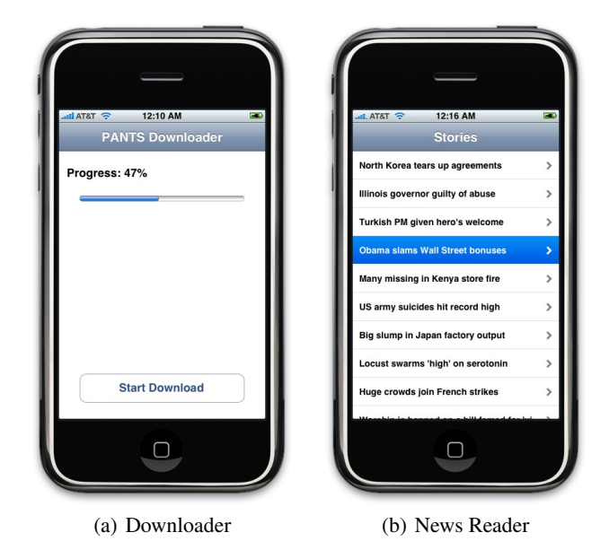
Figure 3: PANTS applications using the web scheme.

We built two sample applications over the web scheme: a File Downloader and a News Reader. We briefly describe