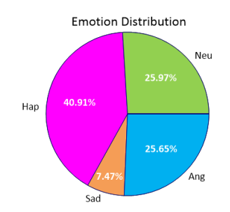
Fig. 1. Class distribution for the emotion recognition task.