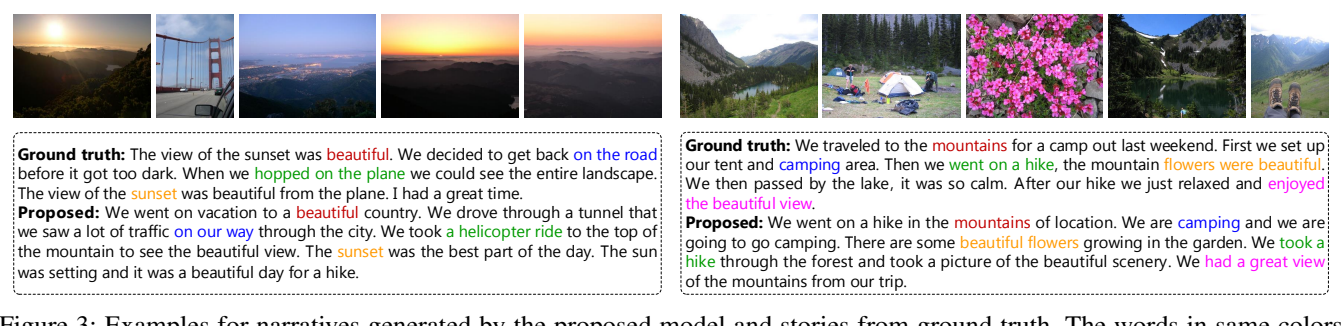
Figure 3: Examples for narratives generated by the proposed model and stories from ground truth. The words in same colors indicate the correct semantic matches between the generated narratives and those from ground truth. [Best viewed in color]

plied for all methods except Regions-Hierarchical (Krause et al. 2017). We keep the two-layer LSTM for word RNN in Regions-Hierarchical and set the hidden size H = 500. The two discriminators are both implemented as a single-layer LSTM with 512 dimensions.