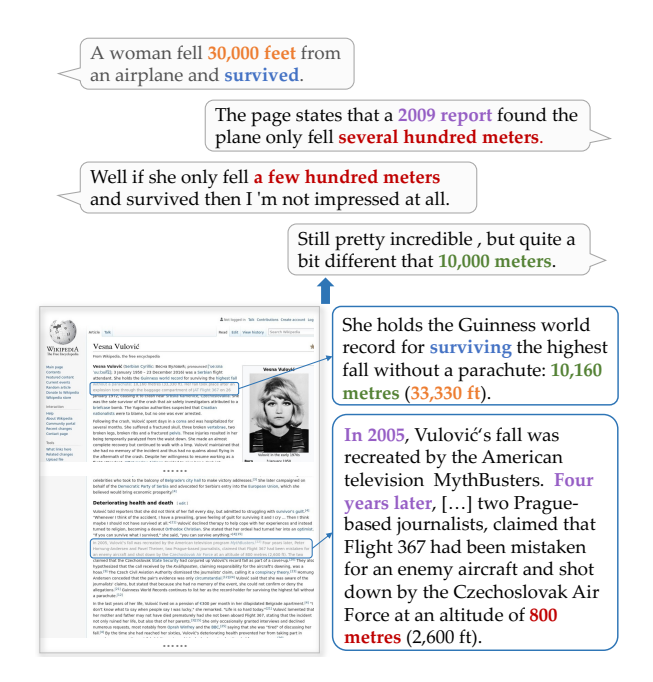
Figure 1: Users discussing a topic defined by a Wikipedia article. In this real-world example from our Reddit dataset, information needed to ground responses is distributed throughout the source document.

While end-to-end neural conversation models (Shang et al., 2015; Sordoni et al., 2015; Vinyals and Le, 2015; Serban et al., 2016; Li et al., 2016a; Gao et al., 2019a, etc.) are effective in learning how to be fluent, their responses are often vacuous and uninformative. A primary challenge thus lies in modeling what to say to make the conversation contentful. Several recent approaches have attempted to address this difficulty by conditioning the language decoder on external information sources, such as knowledge bases (Agarwal et al., 2018; Liu et al., 2018a), review posts (Ghazvininejad et al., 2018; Moghe et al., 2018), and even images (Das et al., 2017; Mostafazadeh et al., 2017).