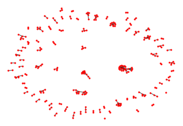
Figure 3: Forwarding network of a post in Hamari Vaani.

posts were shared at least once, and on Hamari Vaani, 58.85% of listened posts were shared. On average, a post was shared 14 times on the two platforms. Across the two platforms, the most popular post received 587 forwards, coming from 52 users.