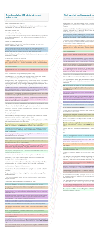
Figure 1: Sentence reuse across two articles on "self-driving cars". Our pipeline detected reuse even across edits, e.g.: "...Musk's own statements issuing lofty goals for production cars or turning a sustained profit starting this quarter" vs "...Musk's own pronouncements such as lofty goals for production cars or turning a sustained profit starting this quarter that might be beyond reach" detected as variants.