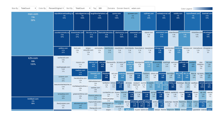
Figure 6: Domain treemap from publisher experience. Cell size and color represent article count and original content respectively for the topic "gun control".

We have analyzed a wide range of news topics including healthcare, self-driving cars, and eSports, as well as more controversial topics such as gun control. Our goal was to understand how news is copied and modified across syndication outlets, local affiliates, and content farms over time, as well as to evaluate and refine our provenance pipeline and the experiences built upon it. Here we describe one such analysis of a controversial news cycle about Kamala Harris – a US Senator whose race and eligibility as a presidential candidate were called into question following the launch of her 2020 US election campaign.