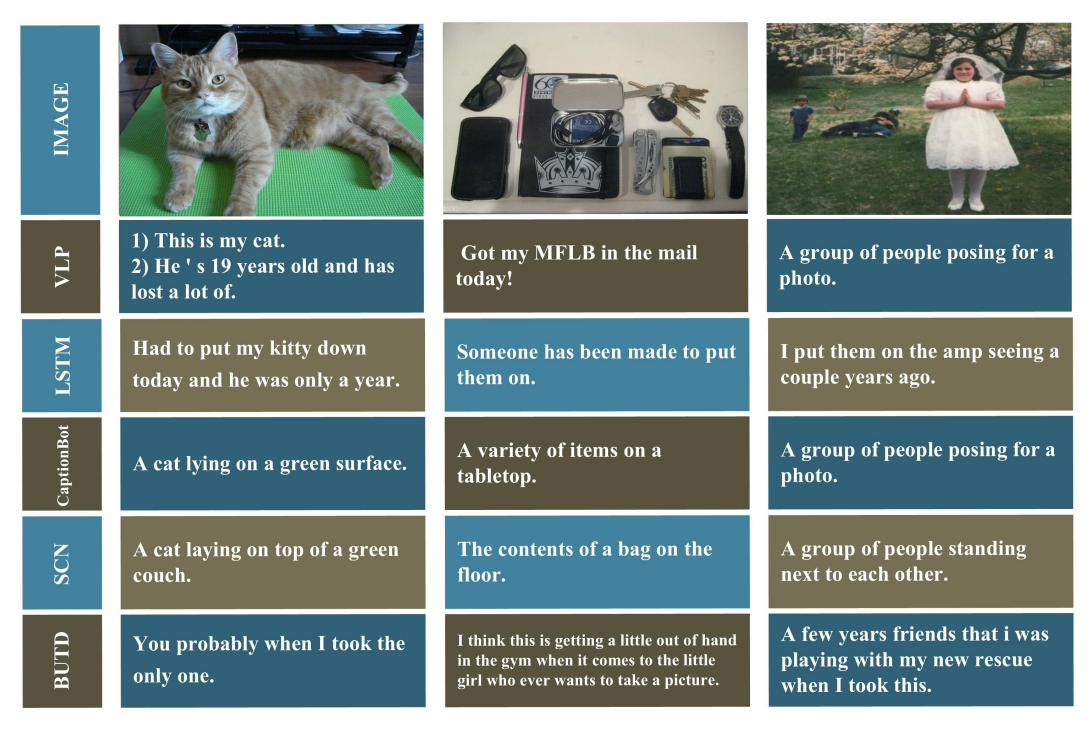
Figure 1: Example comments to user-shared images generated by the baseline models on NICE-Setting I.

Bottom-UP Top-Down Attention (BUTD). Using pretrained object detectors for image captioning has resulted in significant performance gains compared to using CNN features as shown in Anderson et al. (2018). We use this model as a baseline on the NICE-Setting I dataset.